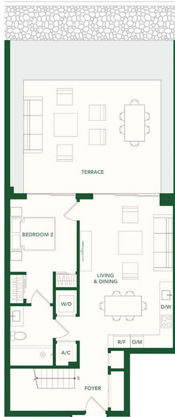
GROUND LEVEL Interior - 762 SF / 71 M 2