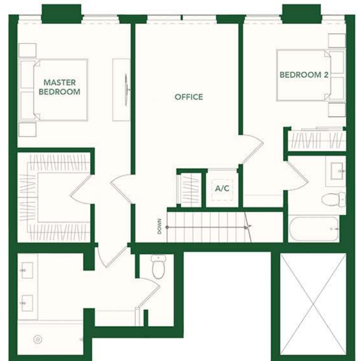
SECOND LEVEL Interior - 894 SF / 83 M 2