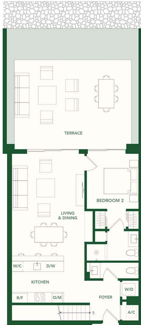
GROUND LEVEL Interior - 850 SF / 79 M 2