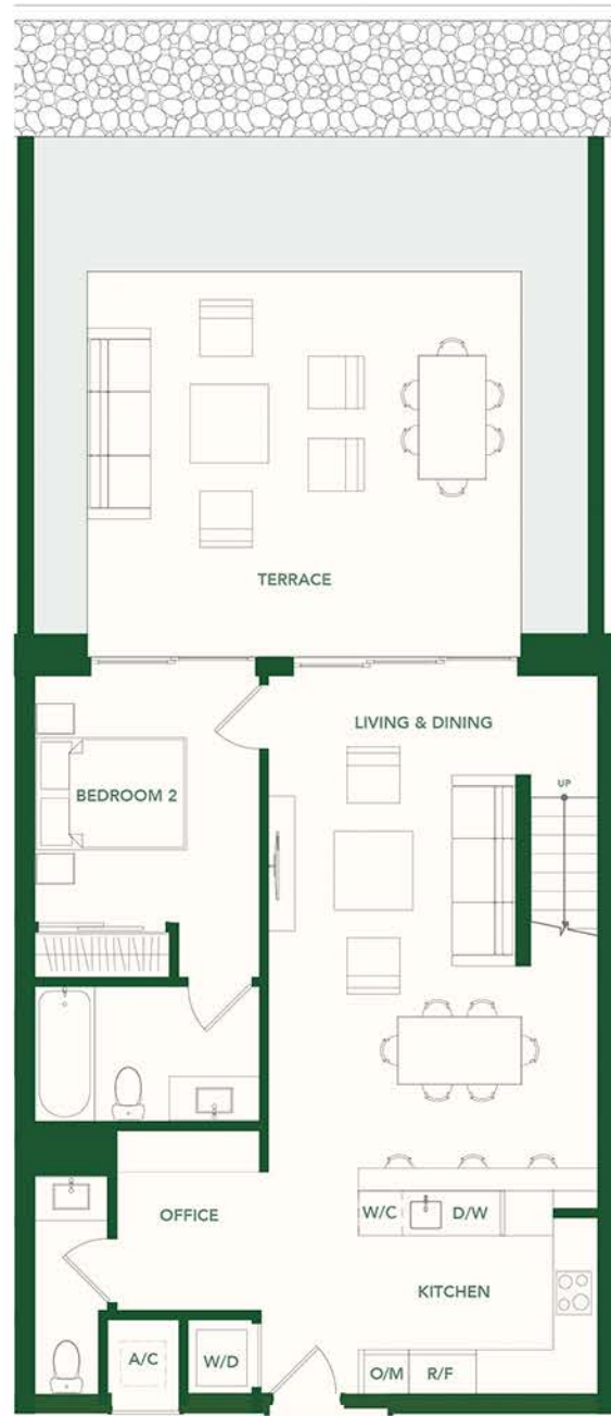
GROUND LEVEL Interior - 873 SF / 81 M 2